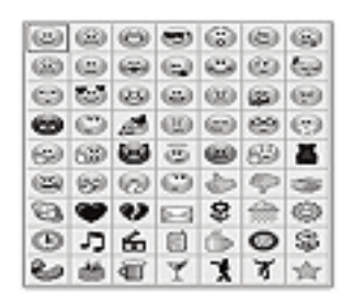
Figure 1 shows the graphical representation of a web chat

When we speak of presence we refer to mental models we have built during our lives. In 3D-DVWs we discard our learned understanding of being present as we have experienced it thus far, and we come to experience a telepresence that can be understood as a digital-virtual being with. For Schlemmer (2008) being present is no longer limited to physical presence as determined by the limits of the physical body, since our new technologised, digital-virtual bodies can be here and there at the same time permit us to construct and explore fresh realities, experiences, and feelings. The study of presence and telepresence in the context of Digital Virtual Technologies -DVTs is at an early stage; we know very little about the perception of presence and feeling as experienced through avatar interaction in 3D-DVW, for example (Schlemmer 2008).