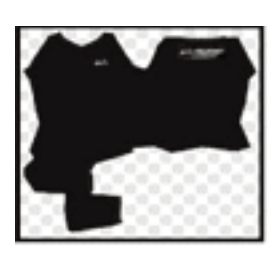
Figure 4 shows a T-shirt texture